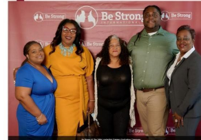
BE STRONG AT THE TABLE LEADERSHIP TRAINING GRADUATION CEREMONY